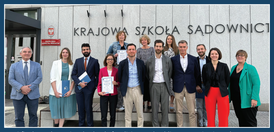
Semi-final D at the National School of Judiciary and Public Prosecution in Krakow