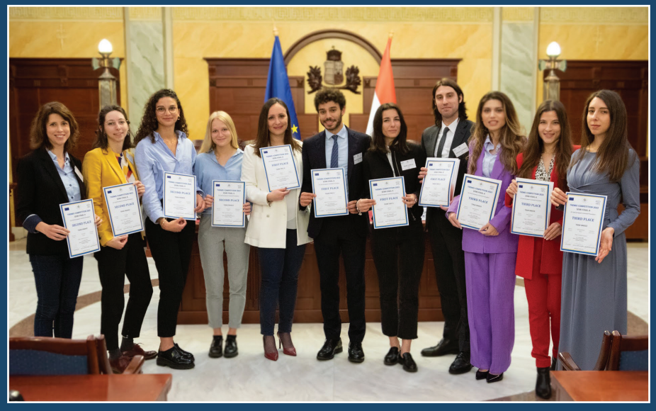
Semi-final A at the Office of the Prosecutor General in Hungary

All of us hope that you will fondly remember and take pride in your contribution to the 2023 THEMIS competition.