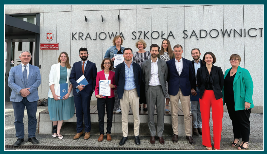
4–7 JULY 2023 – KRAKOW, POLAND – NATIONAL SCHOOL OF JUDICIARY AND PUBLIC PROSECUTION (KSSIP)