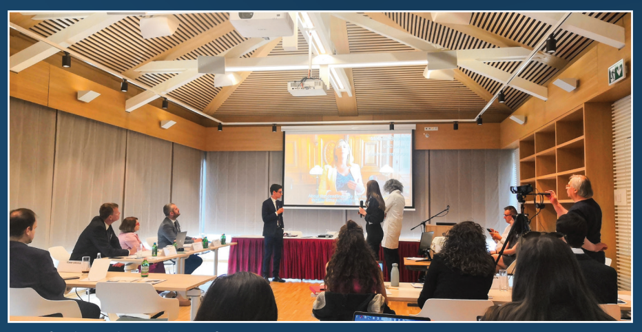
Semi-final C at the Academy of Justice in Hungary