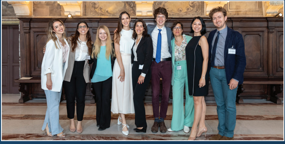
Semi-final B at Naples' Castel Capuano